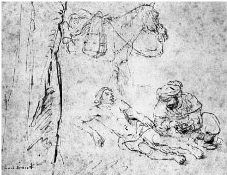
Figure 2: Rembrandt sketch, The Good Samaritan

At the same time, of course, this is a system driven by a kind of anxiety. The anxiety of the firm is that shareholders might take their capital elsewhere – capital will just flee to the places where they can do it. If you don't engage in the game, if you don't innovate, somebody else will, and you'll be out of business. The anxiety within us actually was referred to by Adam Smith a couple of hundred years ago as 'the desire to live a life without shame', a very basic thing. In Adam Smith's day, it was just a linen shirt that you needed to go out in public without shame, and now of course, it's a whole big basket of commodities which we are persuaded are necessary for the good life. It almost convinces