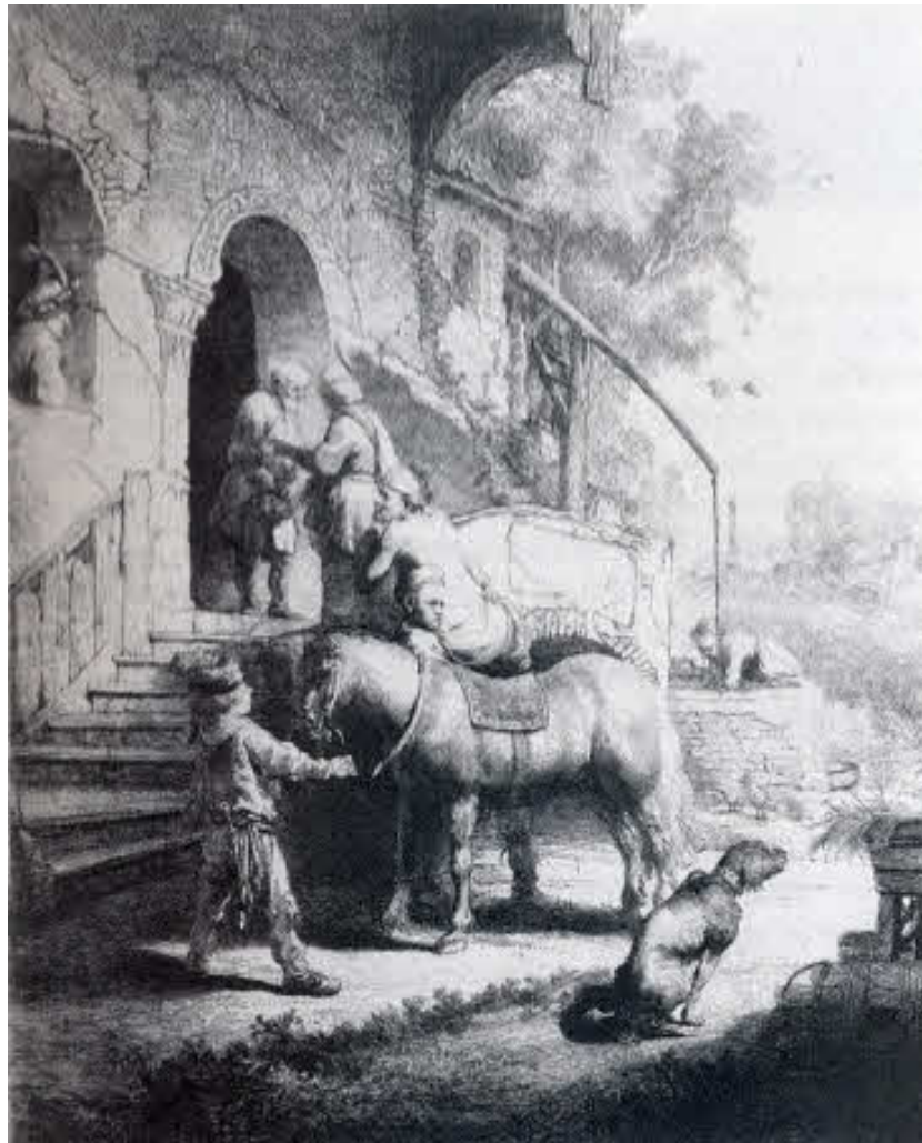
Figure 1: Rembrandt, The Good Samaritan

more goods and services – circular flow. At one level, it's pretty harmless: it's just about the relationship between people – people doing things, making things, for each other, selling them to each other, a set of social relationships. The most interesting part of this relationship is what we do with the money that we don't spend: we put it in banks. Banks then invest it in the economy. Much of that investment over the last years has been into increasing labour productivity, doing things more efficiently, more output with fewer people, year on year. The trouble with that, of course, is that if you do more with fewer people, year on year, unless your economy grows, you're putting people out of work – unemployment is the victim of that. This pursuit of labour productivity almost drives us into having to grow our economies if we want to keep people working all the time.