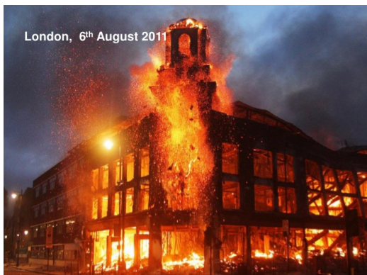
Riots: London Burning

At the heart of this system is what economists call the circular flow of the economy: firms make things for people, we are employed by firms, so we give them our labour and capital, they give us incomes in return, which is great because we can then spend them on