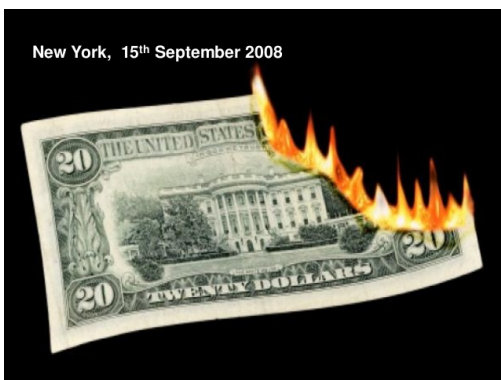
Collapse of Lehman Brothers

In the wake of that crisis, one of the things that really came to the fore is the question of social justice. It should have come to the fore before that. But the crisis did bring social justice into the forefront of the conversations, for the very simple reason that it was the architects of the crisis who had benefited in financial terms from it, and it was also the architects of the crisis who benefited from the austerity programmes that followed it. Austerity politics was about propping up the financial sector again, trying to