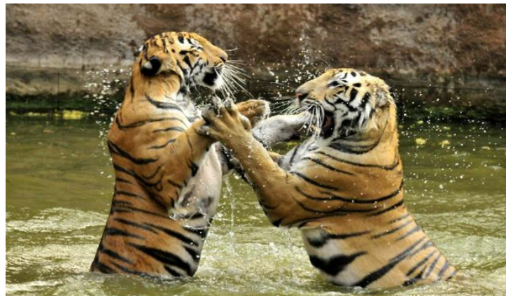
Tigers discussing philosophy?

I want to sketch over the way we have responded to Gauguin's questions. One of the aspects of how we deal with these questions is helped by thinking of ourselves as orphans, born in an orphanage, and orphans make up stories about their parents, usually very glamorous, very elaborate stories. And it seems to me that we are orphans; we are not entirely at home in the universe. And so we have created these enormous disciplines. Science studies the make-up, the materiality, of the orphanage, philosophy helps us to think about how to live well in the orphanage. Only religion tries to get outside the orphanage to ask Gauguin's questions: 'Where do we come from? What are we? Where are we going?'