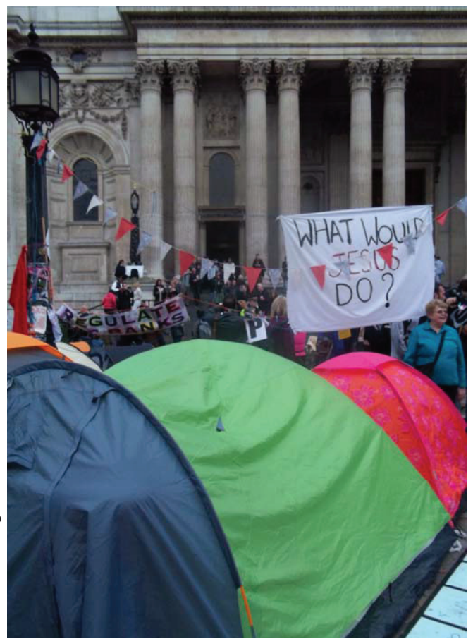
Pregnant tents of the Occupy camp, St Paul's Churchyard, Advent 2011.

In the prologue to St John's gospel it says: 'The word was made flesh and dwelt among us.' The Greek word for 'dwelt' is ἐσκηνωσεν [eskenosen], which literally means 'pitched a tent'. In the camp there was a wire fence-panel where anyone could pin up what they wanted. Among the many writings on this fence, written in Greek and English, it said: ὁ λογος σαρξ ἐγενετο και ἐσκηνωσεν ἐν ὑμιν [ho logos sarx egeneto kai eskenosen en humin]: the Word was made flesh and pitched its tent among us.