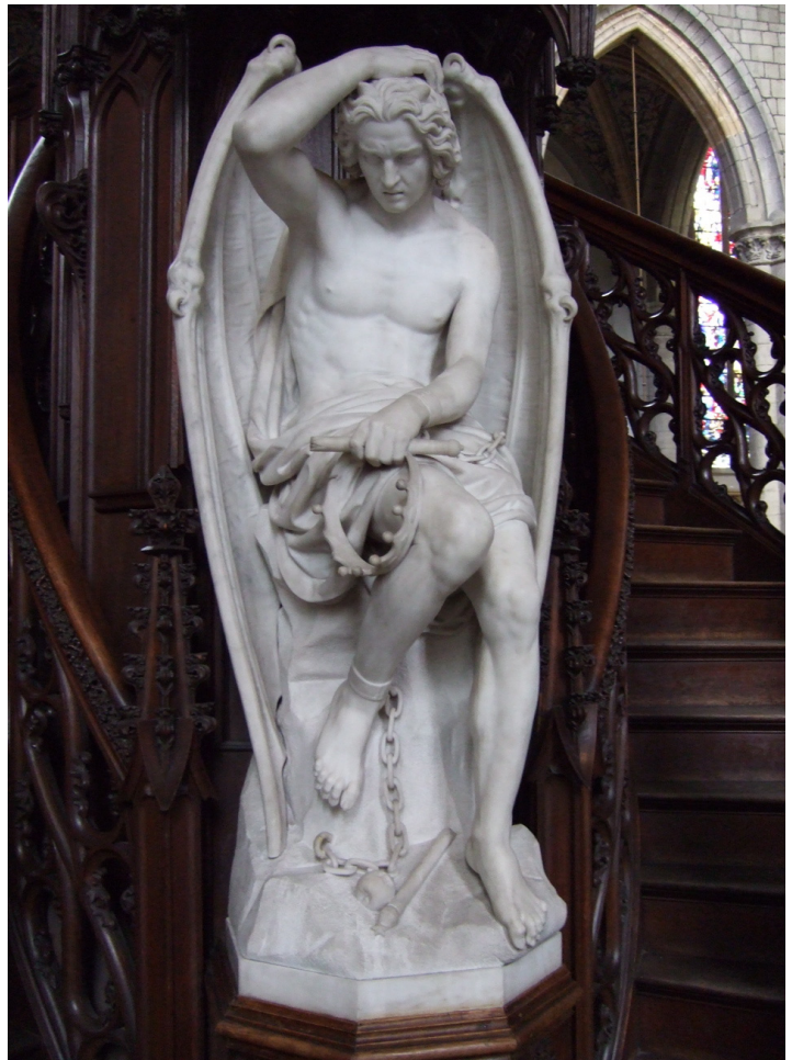
Lucifer chained. By Guillaume Geefs in the cathedral of St Paul de Liège

You don't need to be Derrida to be able to spot Milton's difficulties. They were obvious enough to William Empson and indeed to William Blake, who pronounced very sagely that Milton 'was of the Devil's party without knowing it'. But Blake is himself in the same position! His Lucifer is iconographically indistinguishable from the figure of the risen and ascended Christ, who in Revelation proclaims himself 'the bright morning star' (22:16). Odder, Jesus also promises to 'give the morning star' to the one who chooses and stays with the right side in the controversies at Thyatira (Rev 2:28). This suggests that the modern difficulties about the relations between God, Christ and Satan, although they have been exposed by political change, have an origin that goes back deep into the New Testament itself. We need first a brief summary of the strange pattern of resemblances, reversals and contrasts that links the two great and closely inter-twined figures of Christ and Satan: