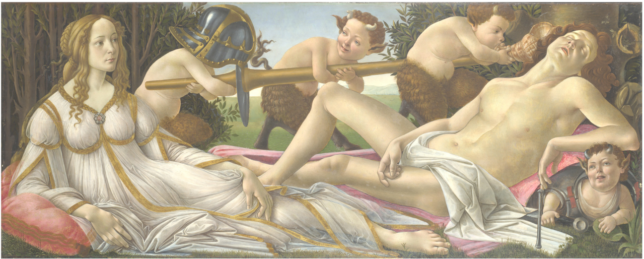
Sandro Botticelli, Mars and Venus c. 1483. National Gallery.

argued by Kant, Hegel, Marx, James, Heidegger, Wittgenstein and many others including many modern theologians. It has gone by various names, but for present purposes let's just call it non-realism. The essence of non-realism is that it conceives of human knowledge as creative activity, not as passive reception. We know what we know, not because we receive data from 'out there', but because together we construct patterns of understanding through our encounters with each other and with the world. In these encounters, by means of our symbolic systems including language and mathematics, we are active agents. None of this denies the existence of a world external to ourselves but it insists that any knowledge we have of this world arises from our own active, creative engagement with it. Its central concern is therefore not objective existence, but rather human meaning.